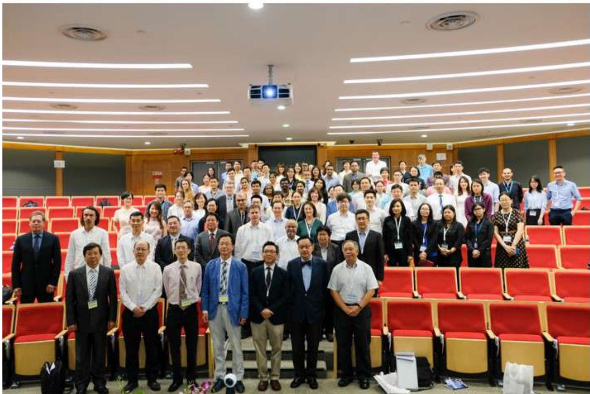
Clinical Research Centre Auditorium, Level 1, Block MD11, 10 Medical Drive, Singapore