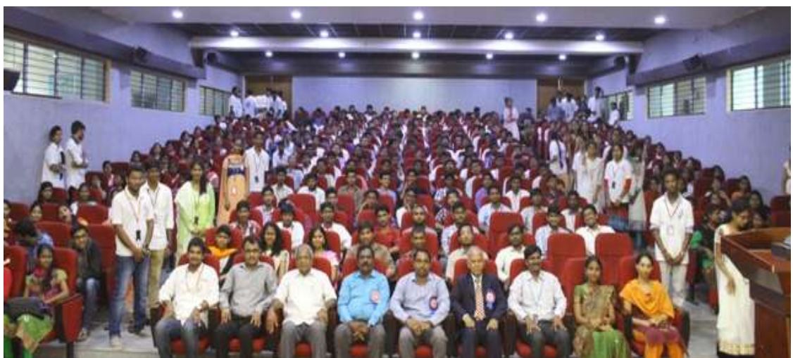
Group photo with Guest and Volunteers