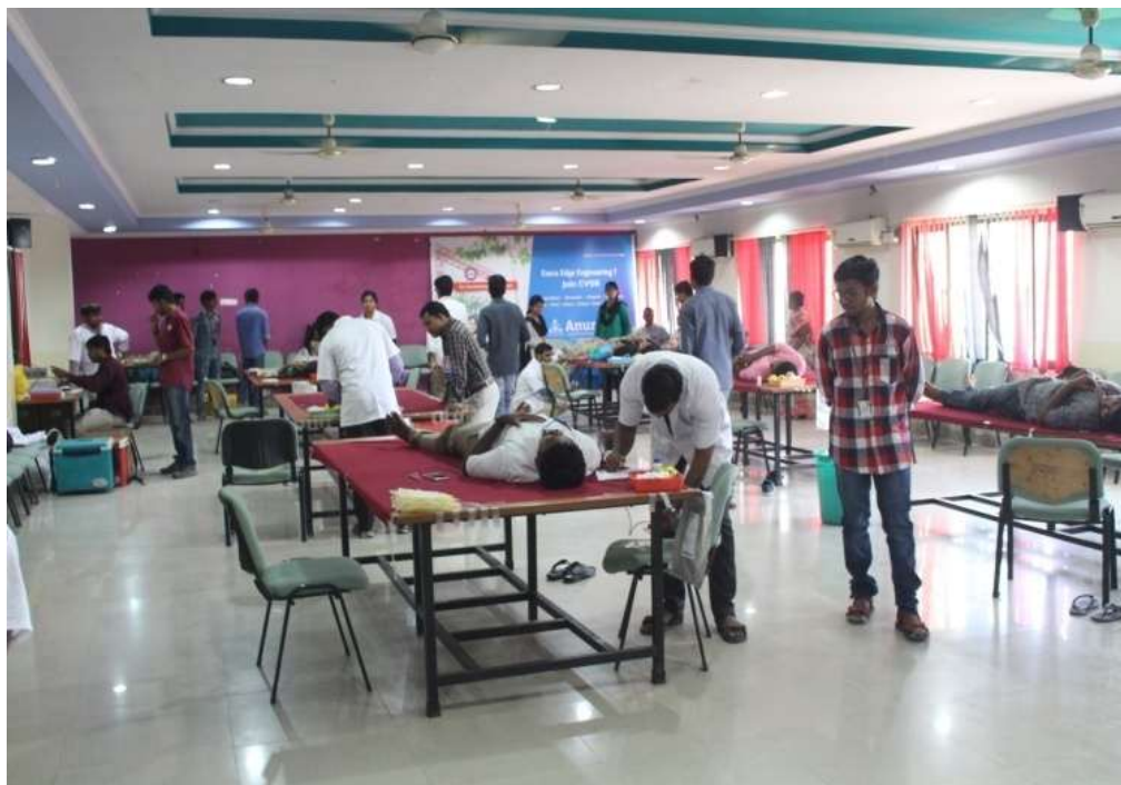
Volunteers Donating the Blood