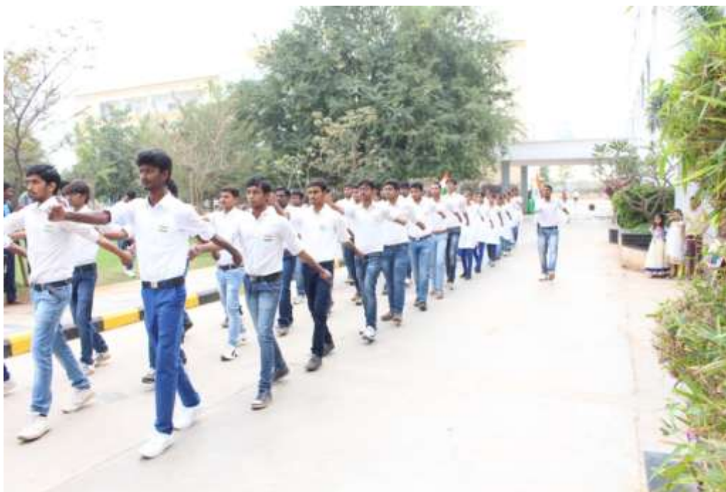
Volunteers doing the parade along with commander