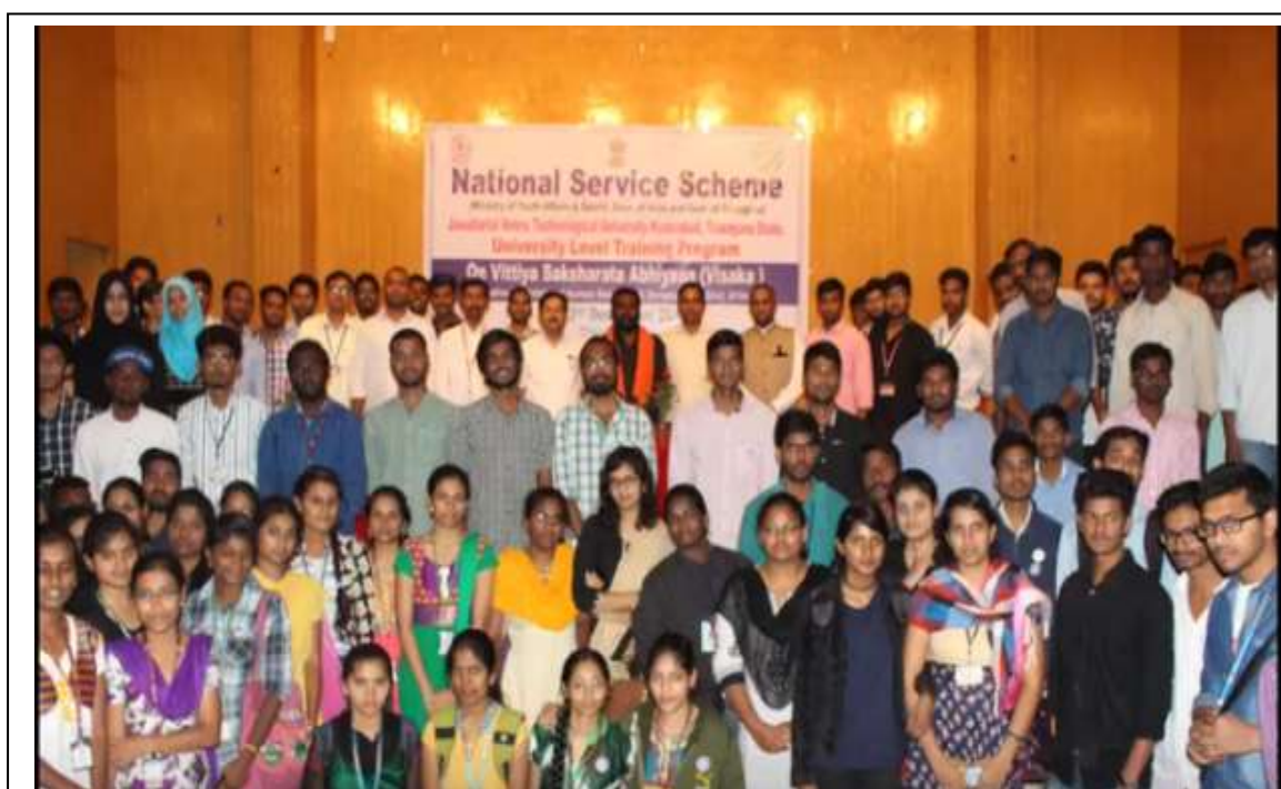
Group picture at University level training programme