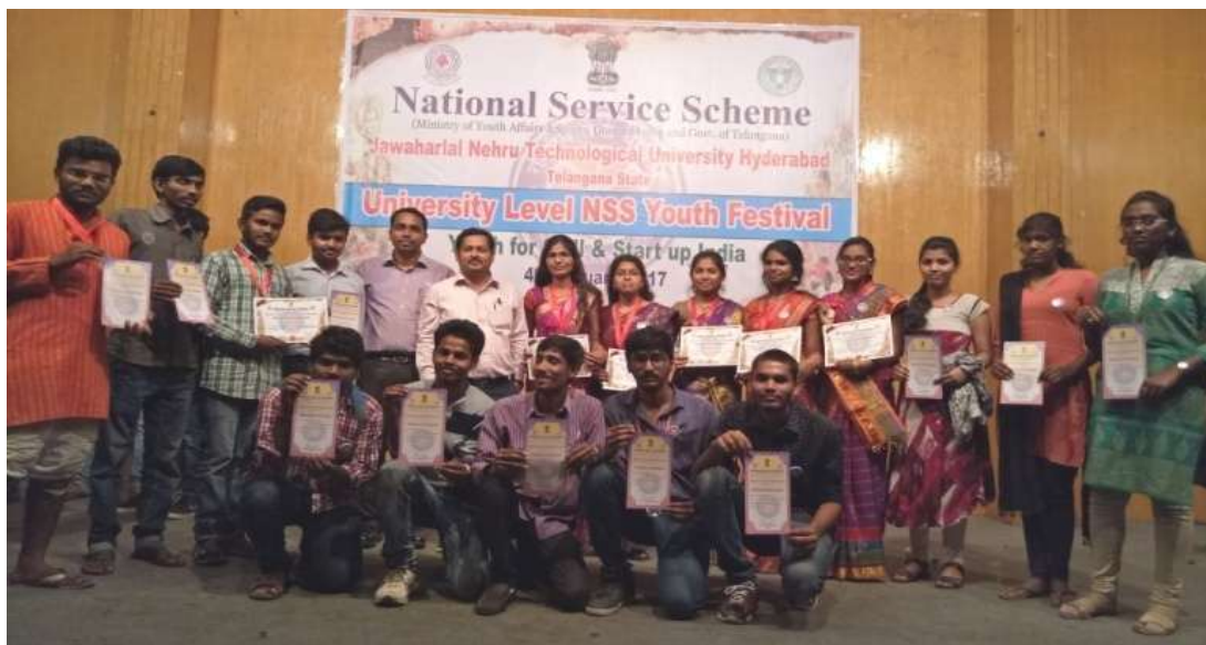
University level first price in dance and folk singing

Anurag group of institutions –NSS Volunteers had participated in the University Level Youth Festival conducted at JNTUH on 04-02-2017. The total number of participants were 19(Boys=11 & Girls=8). Our Volunteers participated in many events like Rangoli, Classical Dance, Solo Singing(folk), Essay writing, Quiz, Elocution, Debate, Poster Presentation. Our college volunteers achieved the first prize in Group Dance and Solo Singing (folk). Total 7 volunteers are selected for state level youth festival.