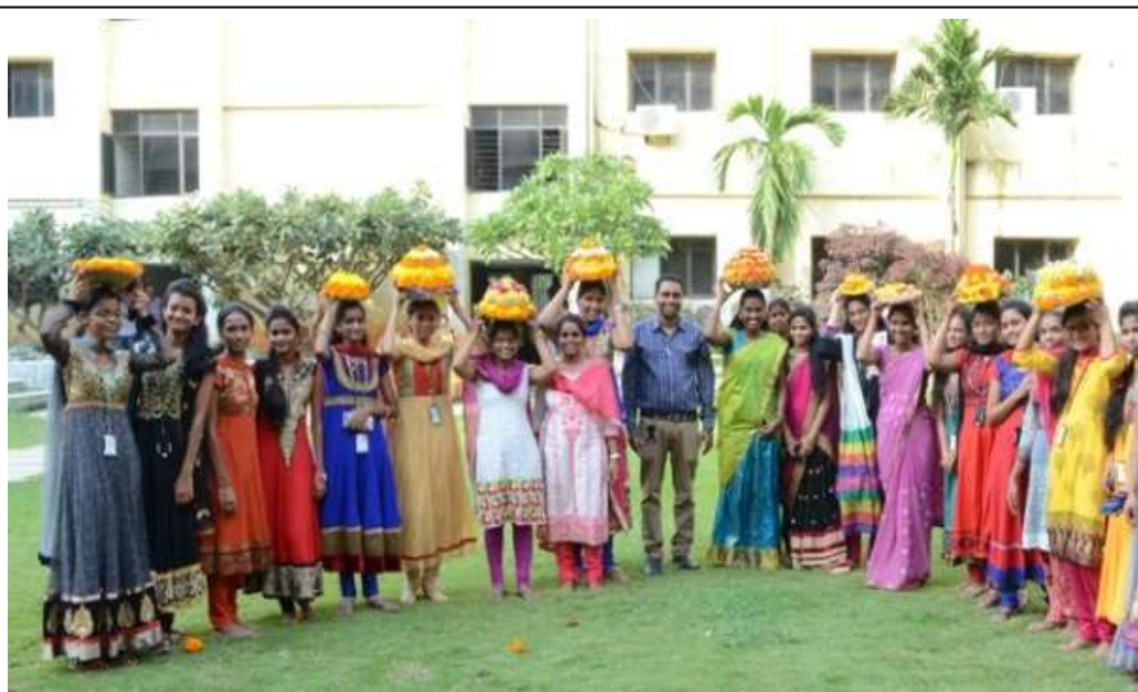
Group picture with programme officer and volunteers

Anurag Group of Institutions, National Service Scheme Organized Bathukamma in college Campus and given information about festival to the modern generation student's i.e. Bathukamma is floral festival celebrated by the Hindu women of Telangana.