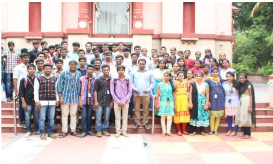
Group picture at R.K. Matt

To strengthen the thoughts of today's youth, Ramakrishna math, Vivekananda Institute of Human Excellence conducted a Youth convention programme Anurag Group of Institutions was a part of the event.