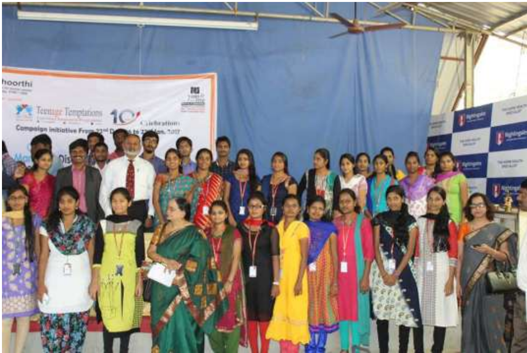
Group picture with all guest members and volunteer

AGI NSS volunteers participated in the marriage and premarriage awareness programme conducted by Dr.C.Veerender on 22 nd December,2016 at somajiguda.