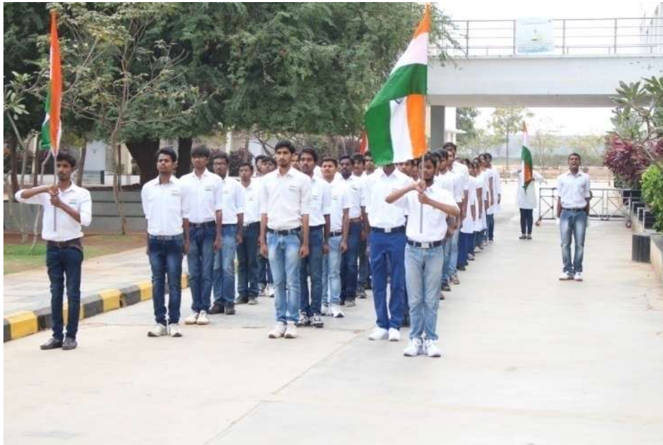
Parede team with commander

National service scheme conducted the Republic Day celebrations on 26-01-2017. Total six events were conducted on the occasion of the Republic Day were Parade, Essay Writing, Poster Presentation, Rangoli, Singing and Dancing.