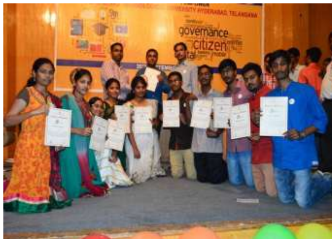
Won the first price at university level Digital India Workshop