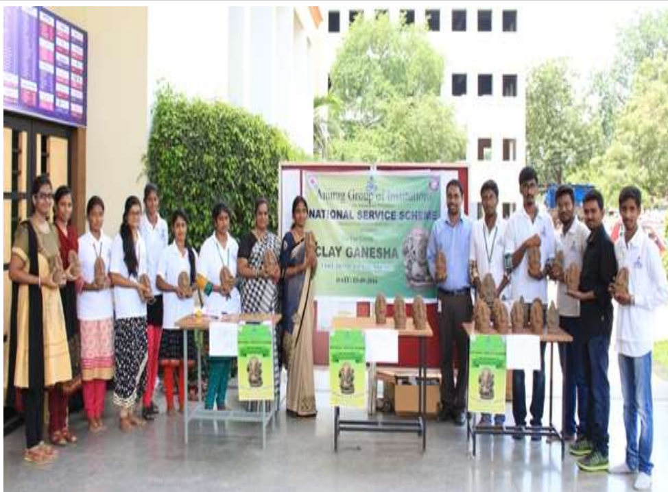
Group pictures with event organizer and programmer officers

As part of Environment Protection Anurag Group of Institution, National Service Scheme Organized 2 weeks Clay Ganesha awareness Programme and distributed 146 Clay Ganesha Idols to the Faculty, Students and nearby village people and given them awareness on Importance of Environment protection by eco-friendly ganesha.