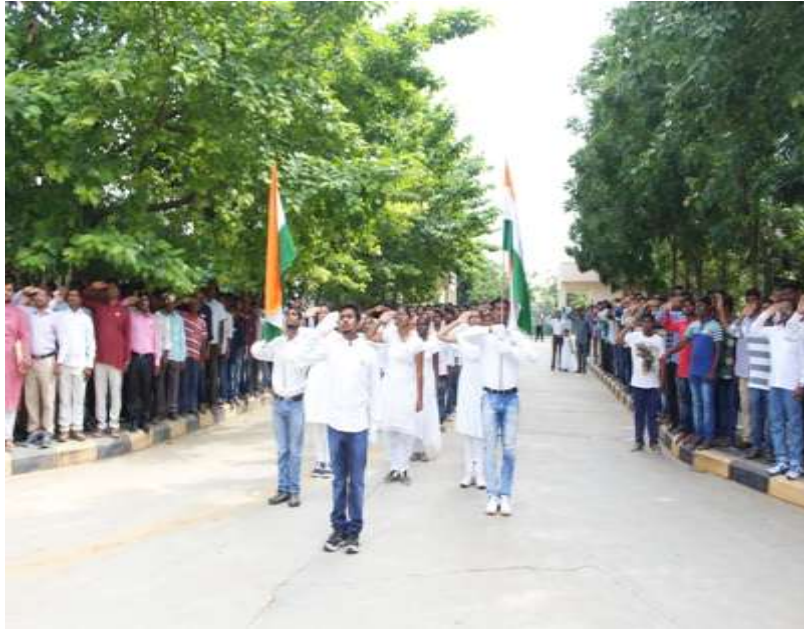
Parade saluting the National flag