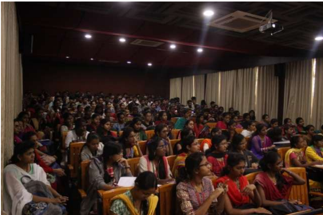
Volunteers during the season of Cashless transactions