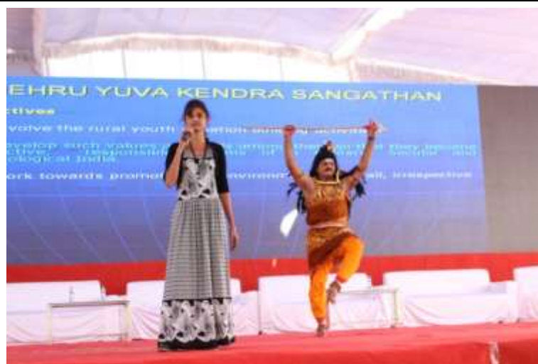
Inauguration song at peoples plaza

Anurag group of institutions –NSS Volunteers actively participated in the Youth Convention Program at Peoples Plaza, Necklace Road on 17-02-2017. Total 76 (Boys=40&Girls=36) NSS Volunteers actively participated in the programme.