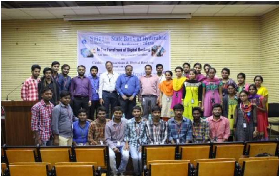
Group picture with guest and volunteers