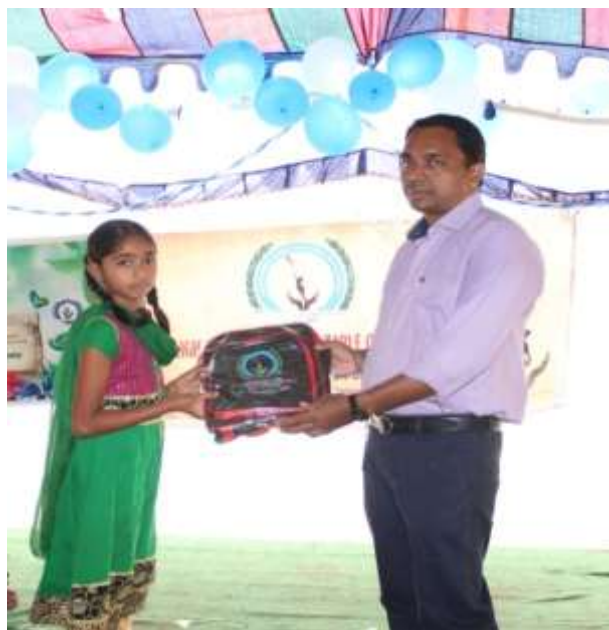
Donating the schools bags to Students