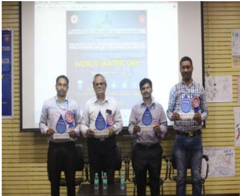
Programme officers along with senior Director