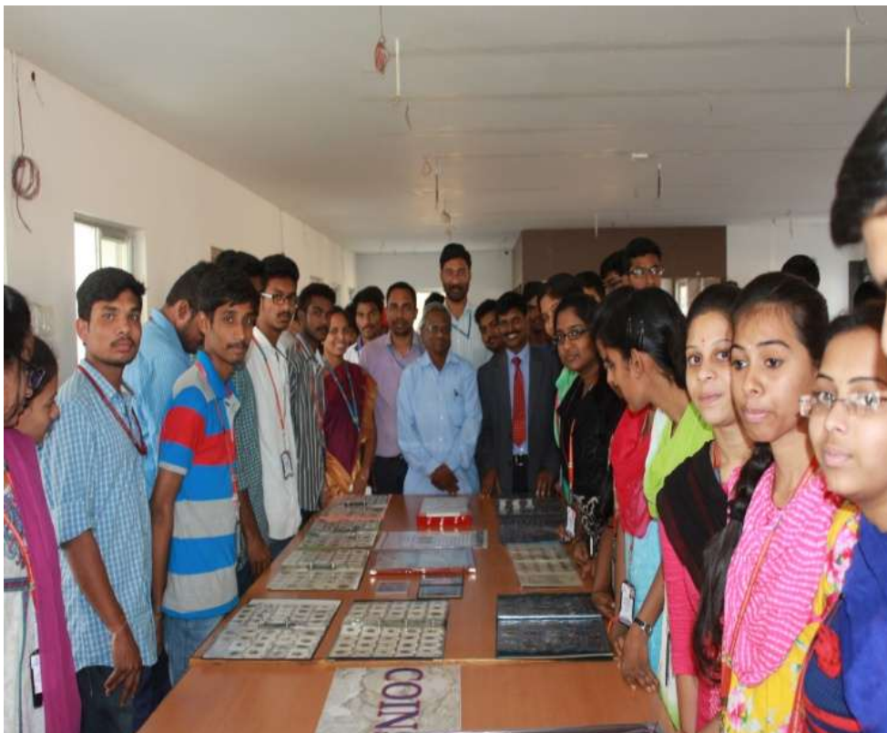
Group picture with all members and volunteers