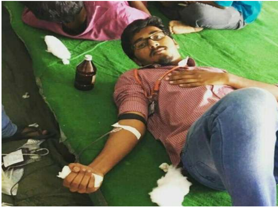
Volunteers are donating the blood