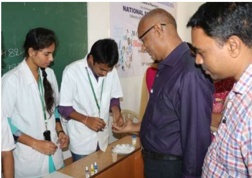
Blood Group Checking