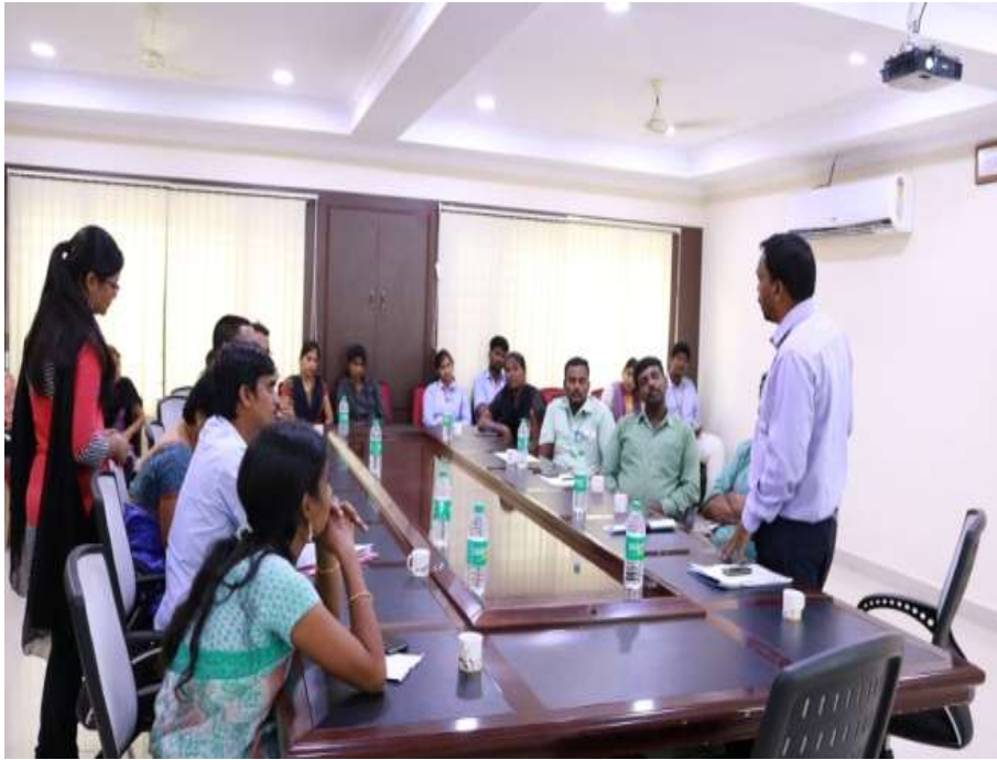
Discussion about the NSS events and upcoming future activates with coordinators