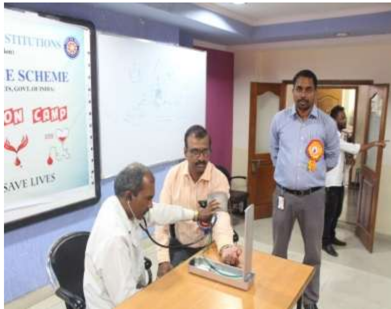
Doctor checking the Blood Pressure