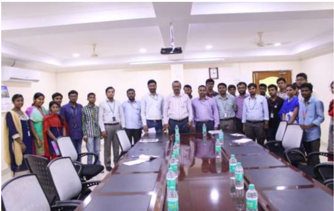
Group picture with all NSS advisory committee members