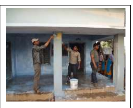
Whitewashing the outer walls