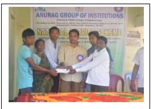
Helping the families