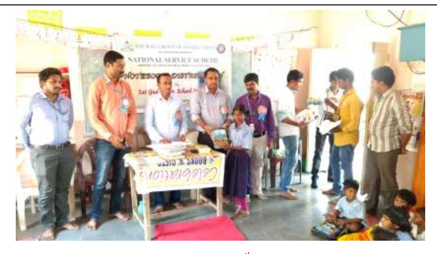
Books distribution to 4<sup>th</sup> class student