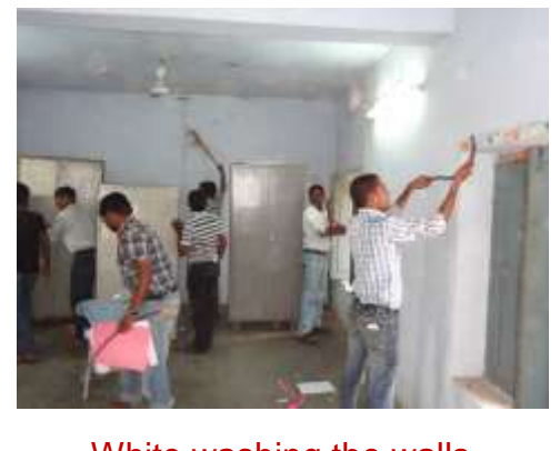
White washing the walls