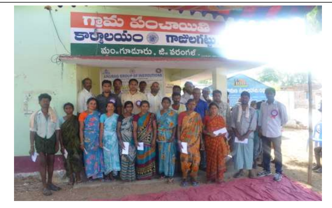
Families in the village affected by the hillstorm