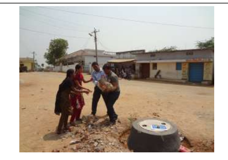
Claarance of waste